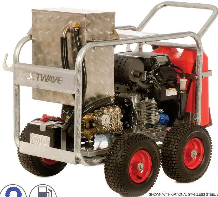
SHOWN WITH OPTIONAL STAINLESS STEEL WATER TANK.