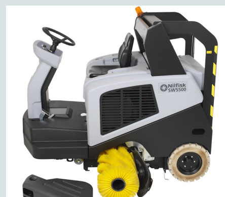
Fast and easy replacement of main components to make it easy daily operations and reduce downtime