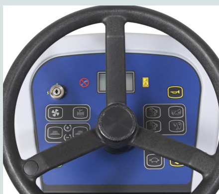
Control panel with icon buttons and modern display to reach best in class ease of use